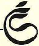
EXHIBIT "A" to Bylaw No. 429/22